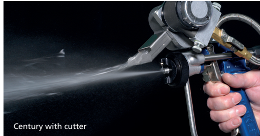
Century with cutter