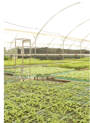
Fig. 1: 3A Composites Core Materials Ecuador balsa nursery overview.