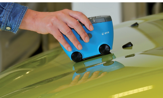
Measurement of surface quality (BYK, Wave Scan Dual)

You will achieve class A-FRP surfaces using this new system and at the same time massively reduce the working time on the component. Application of a tiecoat or a barriercoat is no longer necessary, whereby possible sources of error are also eliminated. A simplified process reduces waste and subsequent tasks (e.g. due to polishing) to a minimum and yield perfect, finished-casting surface results. After gelcoat application, work proceeds exclusively in a closed mould process, hence protected from human and environmental effects.